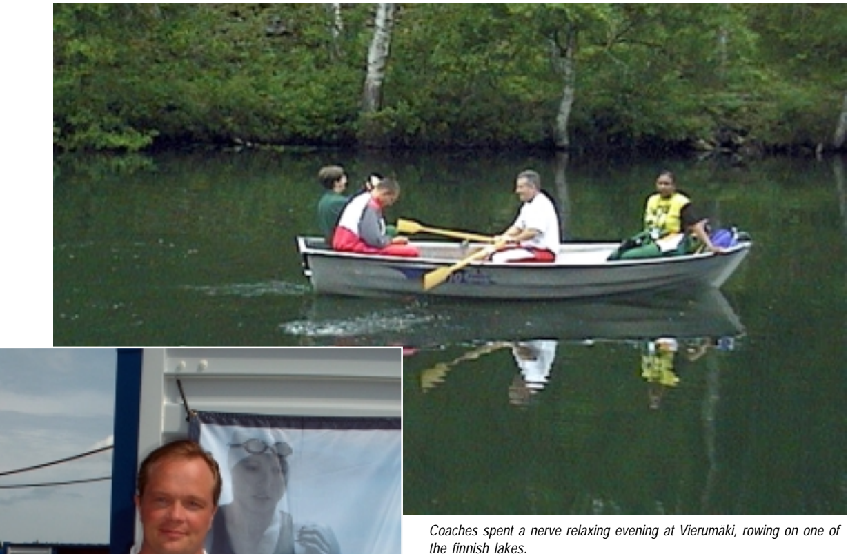
the finnish lakes.