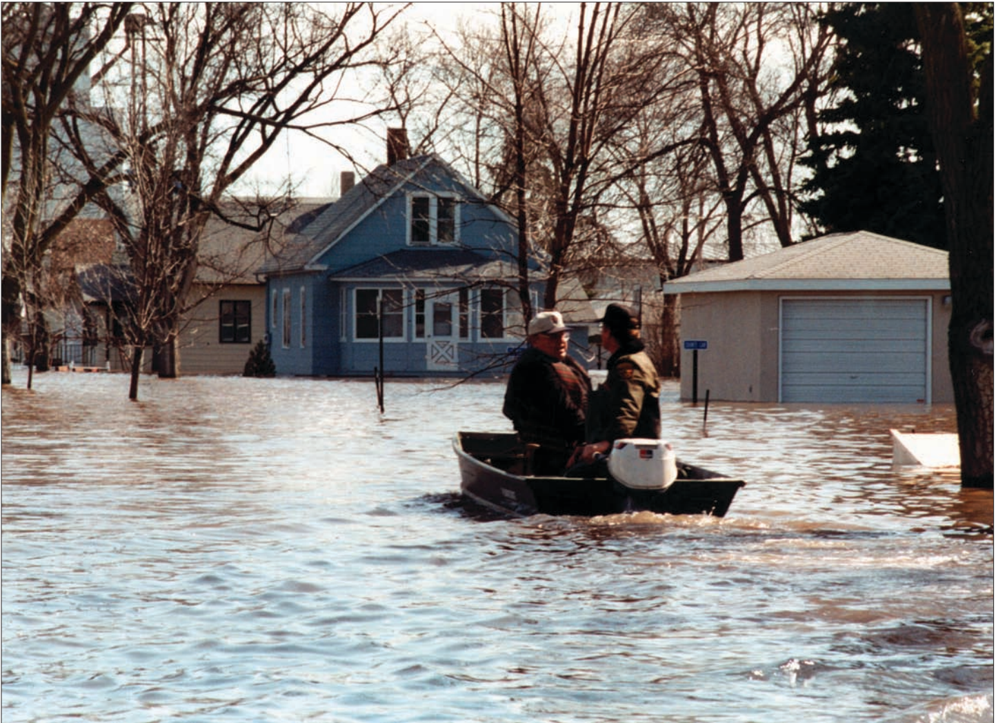
Breckenridge, Minnesota, 1997

community must adopt based on the type of flood hazard data provided to the community.