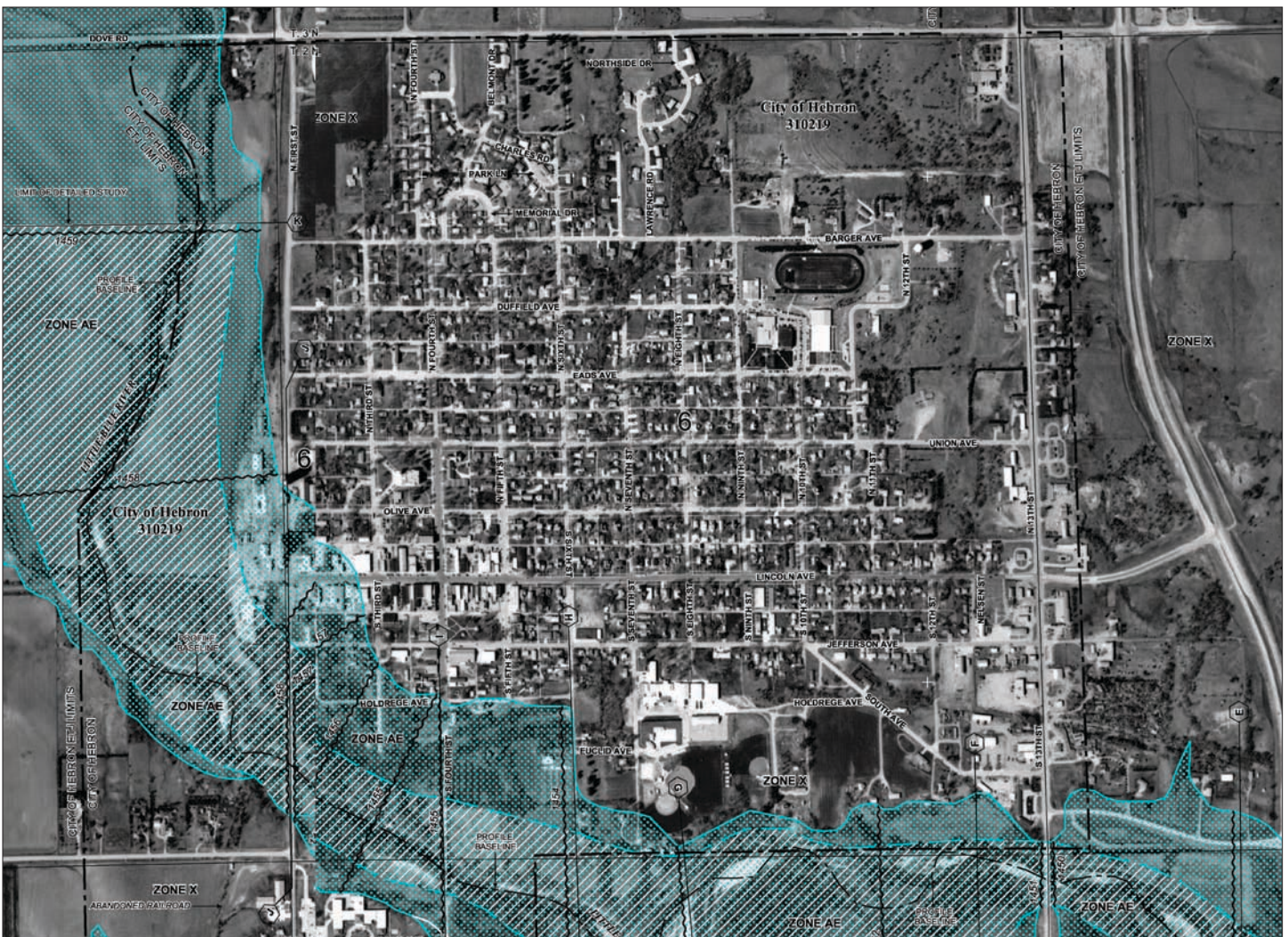
Digital Flood Map

agencies are participating with FEMA in developing and updating flood maps. (See the box on the inside of the back cover page for a brief description of the CTP program.)