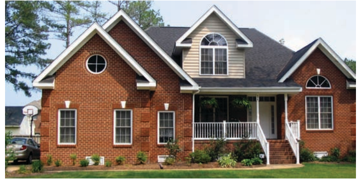
Elevated home on crawl space foundation