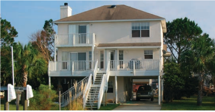
Elevated home on pile foundation