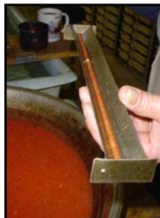
Counting eggs using the Von Bayer method.

Rainbow trout spawning for the winter is complete. Hatchery staff produced over 3 million disease-free rainbow trout eggs and shipped them all across the country to hatcheries in Arkansas, Arizona, Georgia, Kentucky, Massachusetts, Missouri, New Hampshire, New Mexico, New York, North Carolina, and Virginia. Eggs and sperm are stripped from the fish by hand, fertilized and incubated for 2 weeks until an eye forms on the developing embryo. Just before they hatch eggs are sorted, counted and shipped overnight.