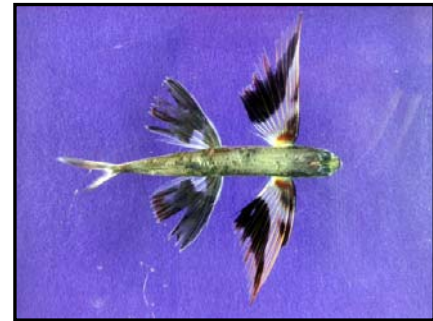
The band-wing flying fish.

Flying fish are a unique because they launch themselves out of the water and "fly" through the air using their tails and their wing-like fins. Scientists do not know for sure why they fly but it might be to escape predators or to save energy while traveling long distances.