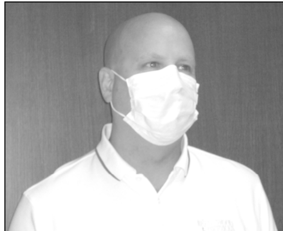
Figure 5.3 Patient wearing a surgical mask. This mask is designed to stop droplet nuclei from being spread (exhaled) by the patient.