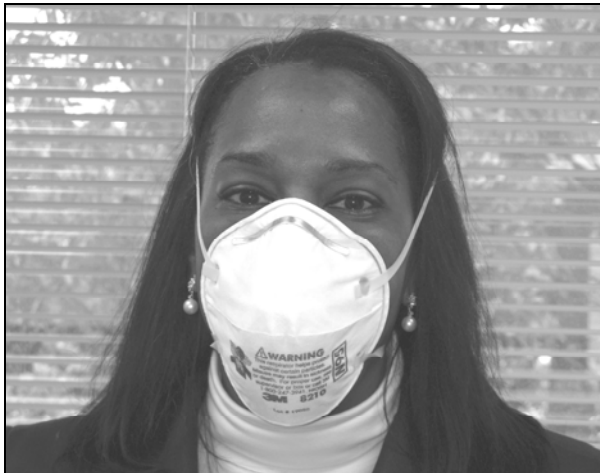
Figure 5.2 Health care worker wearing a personal respirator.