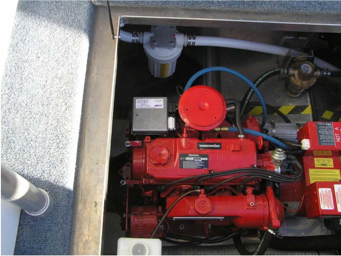
Figure 3. Photo of Westerbeke Generator with Zenith Electronic Fuel Injection kit.