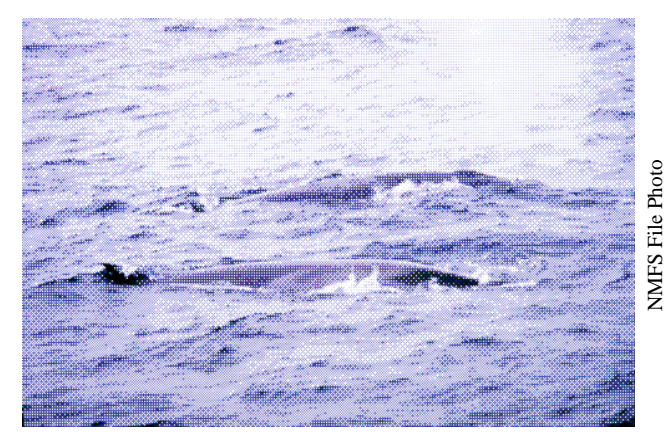
Female Sei whales can be slightly longer than males.

Sei whales make almost all of the world's oceans their home, living in both shelf and oceanic waters. They live as far south as the Antarctic and as far north as Iceland in the North Atlantic Ocean. Sei whales have an unpredictable distribution . Many whales may be found in one area for awhile and then not return for years or decades. This behavior is unusual for rorquals, who generally have a predictable distribution. No one knows where sei whales breed.