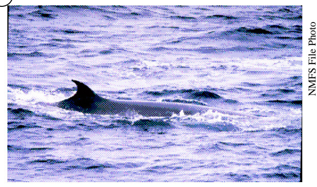
Sei whales have tall, curved dorsal fins

How did the Sei whale get its name? The sei whale (pronounced "sigh whale") is named after the Norwegian word for a fish called pollock: seje. Sei whales received their name because they sometimes gather off the coast of Norway at the same time as the pollock that come to feed on the abundant plankton each year. The scientific name, Balaenoptera borealis, is Greek for "winged whale" and "northern," respectively.