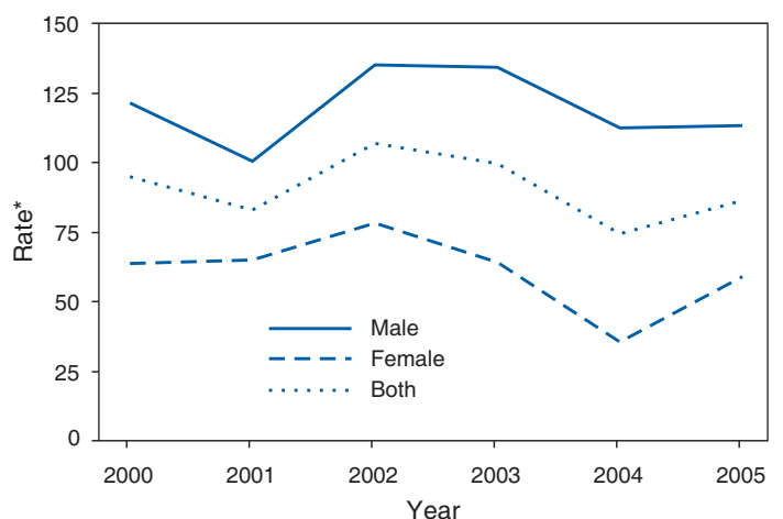
FIGURE 2. Suicide rates in Guaraní population, by sex and year — Mato Grosso do Sul, Brazil, 2000–2005