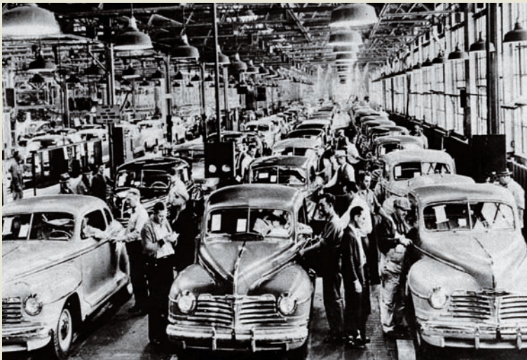
THE HENRY FORD