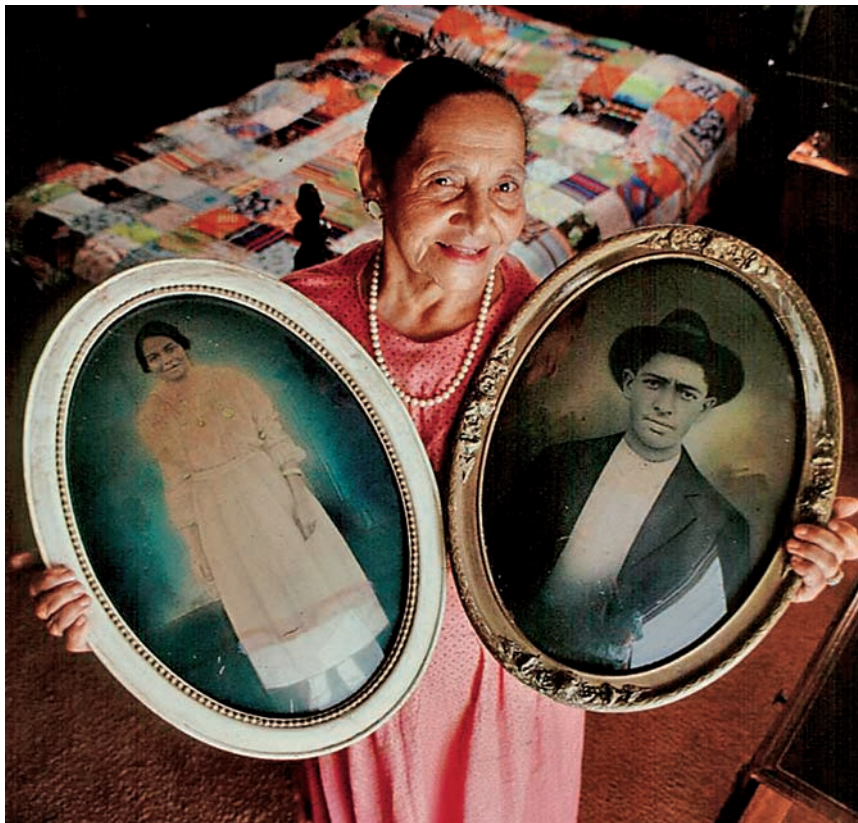
CANE RIVER NATIONAL HERITAGE AREA, PHILIP GOULD

Along the congested Boston-to-Washington corridor, a well-preserved and relatively undeveloped rural landscape in Massachusetts and Connecticut is known locally