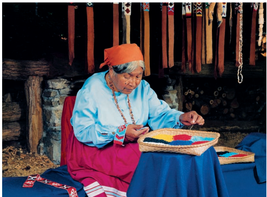
BLUE RIDGE NATIONAL HERITAGE AREA, CHEROKEE HISTORICAL ASSOCIATION

Research indicates that such complex initiatives succeed. Montgomery County Community College is collaborating with the heritage area to fully renovate a local former power plant into an interpretive center with classroom space. The college has adopted the heritage area's mission as part of its curriculum, offering courses to educate residents (and future stewards) about the Schuylkill River's assets.