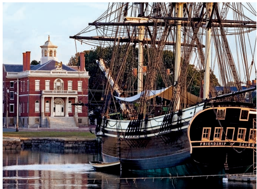
ESSEX NATIONAL HERITAGE AREA

Salem Maritime National Historical Site, the heritage area, and local partners have built a visitor center in downtown Salem that orients tourists and residents to the region’s history,