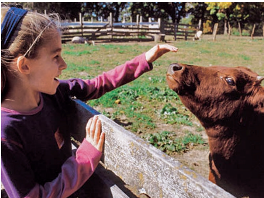
SILOS & SMOKESTACKS NATIONAL HERITAGE AREA