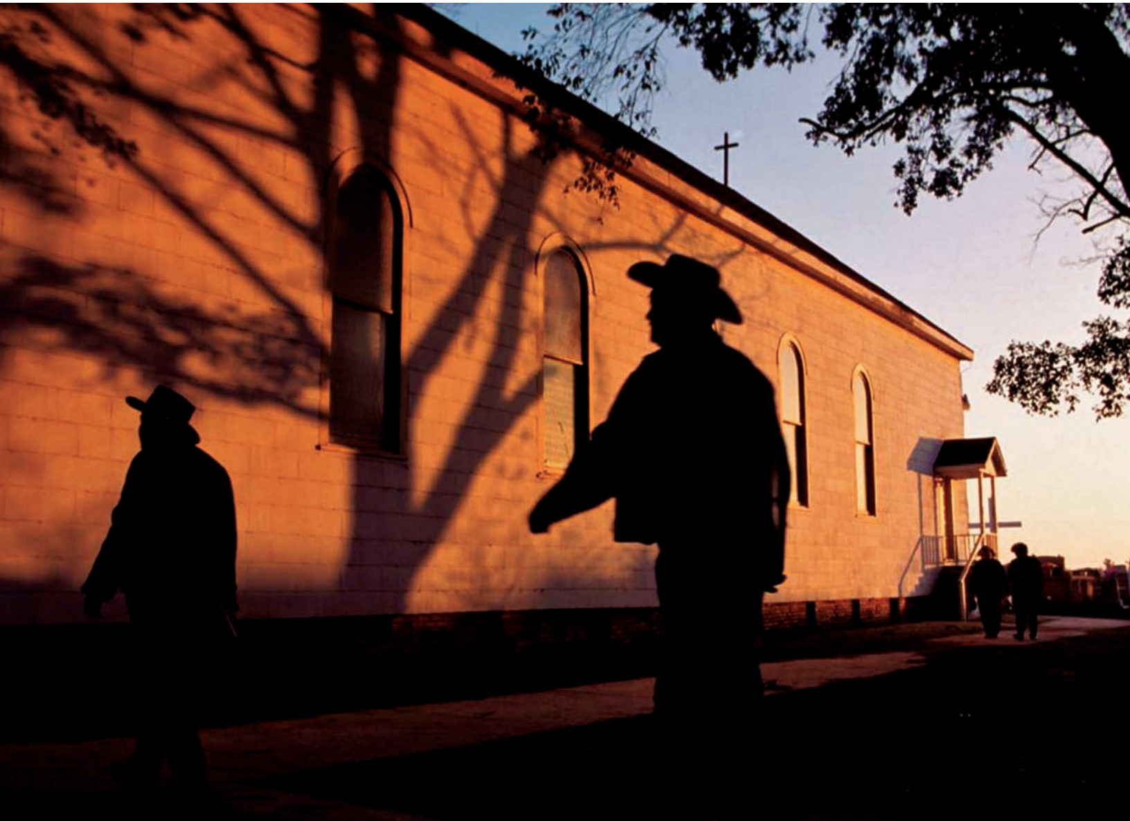
CANE RIVER NATIONAL HERITAGE AREA, PHILIP GOULD

National Heritage Areas knit together the whole landscape and provide an integrated approach to conserving the natural, cultural, historic and scenic resources that define sense of place and shared heritage values, and encourage compatible economic growth.