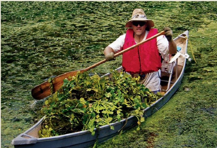
BLACKSTONE RIVER VALLEY NATIONAL HERITAGE CORRIDOR

In the wake of the study report, the commission determined to seek congressional reauthorization to address several options proposed in the study. The Delaware & Lehigh National Heritage Corridor and Cane River National Heritage Area are undertaking similar evaluations to assess their progress and unique management challenges. These studies will provide the National Park Service, heritage areas, Congress, and myriad partners with a clearer understanding of the roles of each stakeholder, similarities and differences in heritage area management, and how partnerships evolve over time.