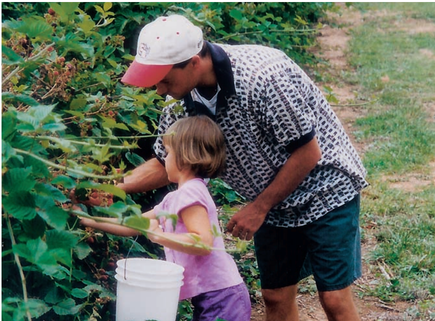
SOUTH CAROLINA NATIONAL HERITAGE CORRIDOR

to preserve regional culture. The heritage area’s archives provide partners with ethnographic information and cultural and industrial artifacts for exhibits, publications, and interpretive programs.