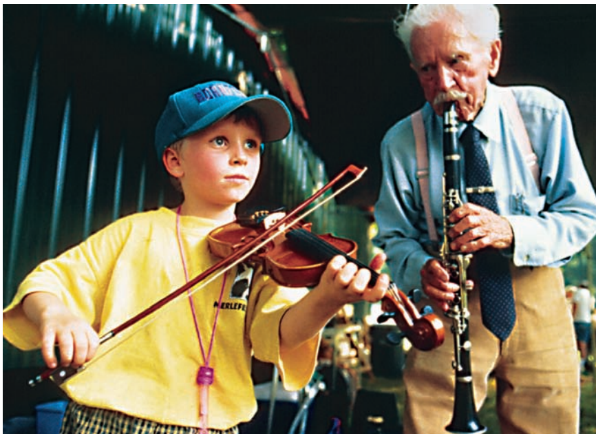
BLUE RIDGE NATIONAL HERITAGE AREA

Each National Heritage Area is unique and needs legislative authority specifically tailored to meet the needs of its region and its resources.