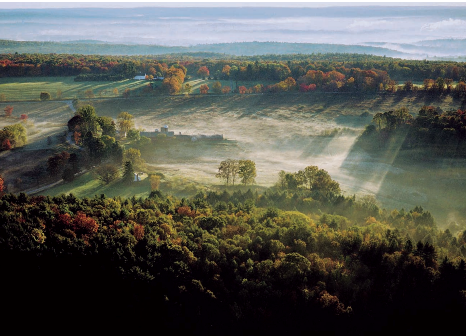
QUINEBAUG AND SHETUCKET RIVERS VALLEY NATIONAL HERITAGE CORRIDOR; COVER PHOTO: BLACKSTONE RIVER VALLEY NATIONAL HERITAGE AREA

National Heritage Areas are places where natural, cultural, historic, and scenic resources combine to form a cohesive, nationally important landscape arising from patterns of human activity shaped by geography. These patterns make National Heritage Areas representative of the national experience through the physical features that remain and the traditions that have evolved in them. These regions are acknowledged by Congress for their capacity to tell nationally important stories about our nation.