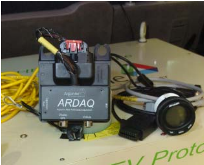
ARDAQ's eight-ounce sensor module package can be quickly installed and can begin collecting information immediately.