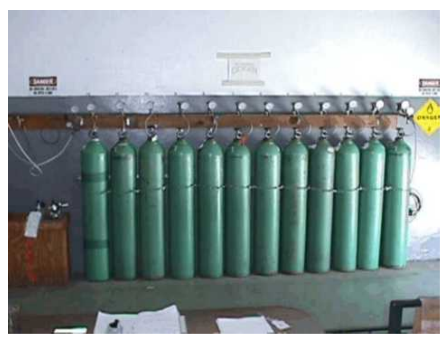
Photo 4: This photo depicts the cascade system used by the fire department to refill the oxygen cylinders. The cascade system is composed of 12 M-size (300 cubic