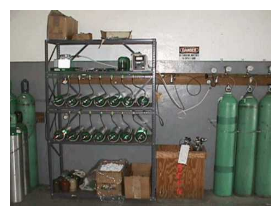
Photo 5: This photo depicts the cascade system at station 34 which is capable of refilling 14 D-size oxygen cylinders at a time. Two banks of 14 cylinders (27 total) are arranged in a storage rack for filling.