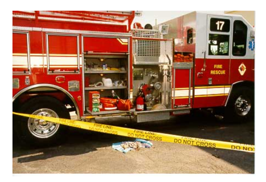
Photo 2 : This photo depicts the incident scene where the victim was severely burned.