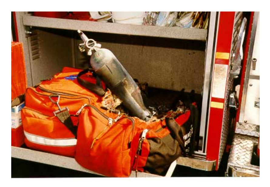
Photo 1 : This photo depicts the airway bag which contained an aluminum cylinder filled with 99.7% pure oxygen, an aluminum regulator attached to the cylinder, and airway supplies.