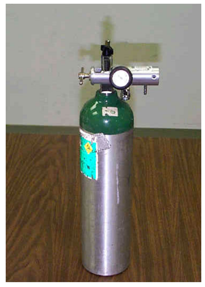
Photo 3: This photo depicts a D-size cylinder similar to the one that was involved in the incident.