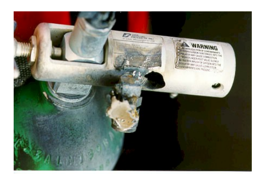
Photo 6: This photo depicts the warning label that is placed on the retrofitted regulator. The sticker serves as a warning as well as an identifier that the regulator has been retrofitted.