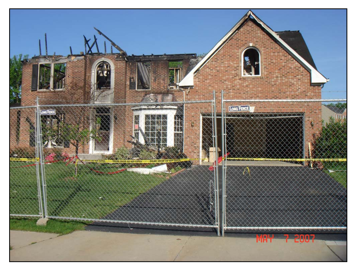
Photo 1: A-side of the structure where the victim entered. The victim was found in the second floor master bedroom above the bay window.