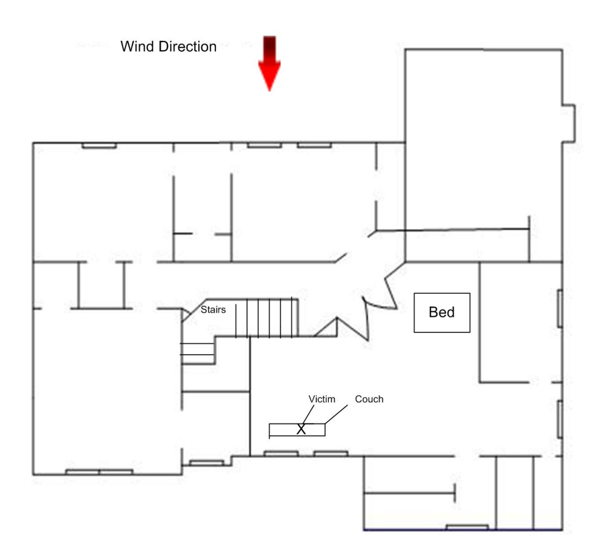
Diagram #2. Location of victim on second floor in master bedroom of fire structure