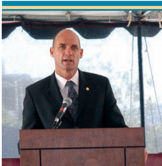
NNSA Administrator Tom D'Agostino

you maintain as a collector's item, has been sitting in your garage for 40 years. You monitor it for such items as a clogged carburetor, corrosion in the engine block and battery