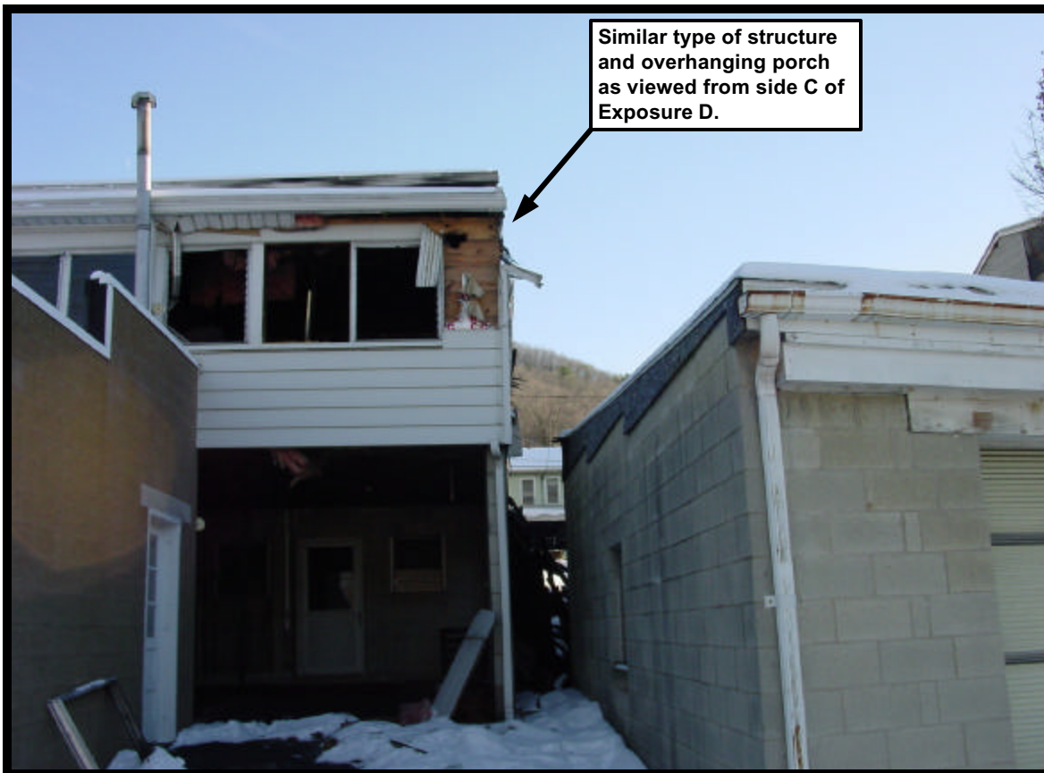
Photo 1. Rear Porch, Exposure D