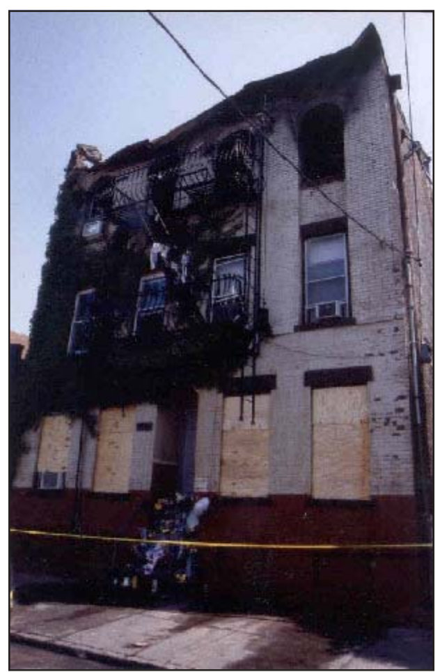
Building involved in fire

On May 9, 2001, a 40-year-old male career fire fighter (the victim) died after he became trapped in a third-floor apartment while searching above the fire for occupants. The victim and Fire Fighter #1, from Truck 2, were assigned to conduct a primary search for a mother and her children who were reported as being trapped in a second-floor apartment. The victim and Fire Fighter #1 conducted a primary search of three of the four apartments on the second floor while two the fire for occupants. The victim and Fire Fighter #1 conducted a primary search of three of the four apartments on the second floor while two the fire for occupants. The victim and Fire Fighter #1 conducted a primary search of three of the four apartments on the second floor while two