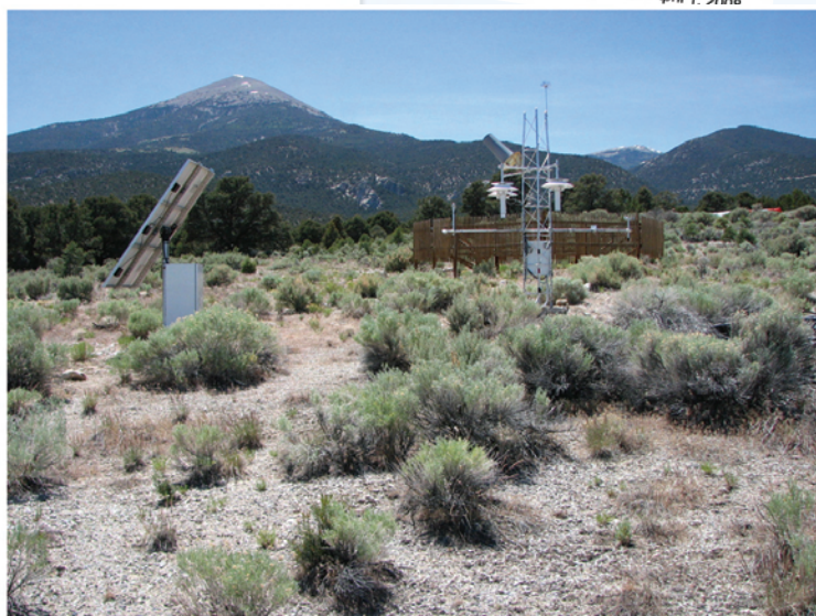
Image : A CRN station in Baker, NV.