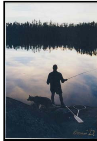
“Casting Into the Evening” by Bonnie DuFresne. 40 th Anniversary Wilderness Photo Contest.