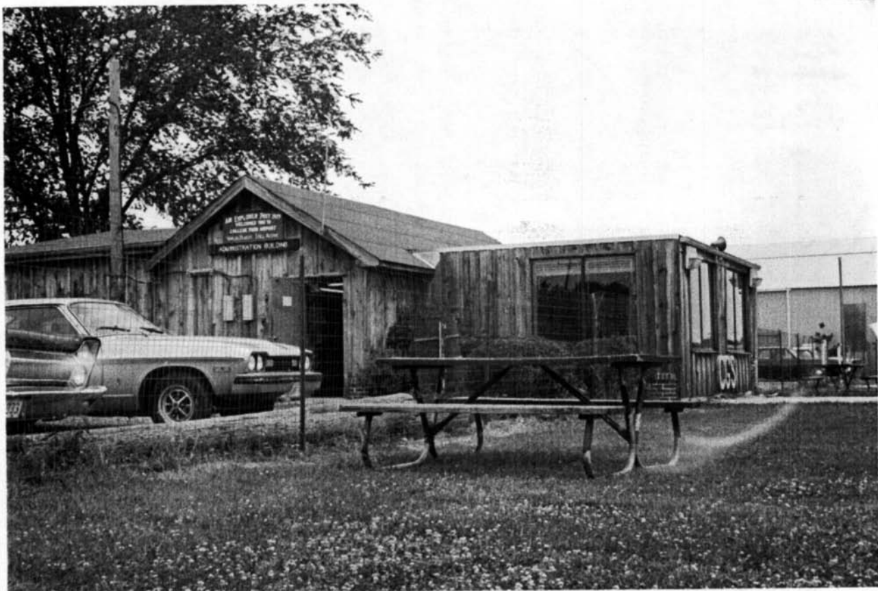
College Park Airport Operations Building