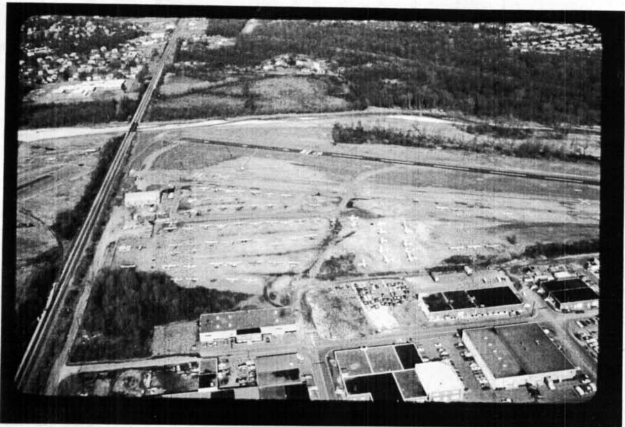
Aerial photo of College Park Airport - July 1976