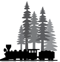
Table of Contents - Volume II