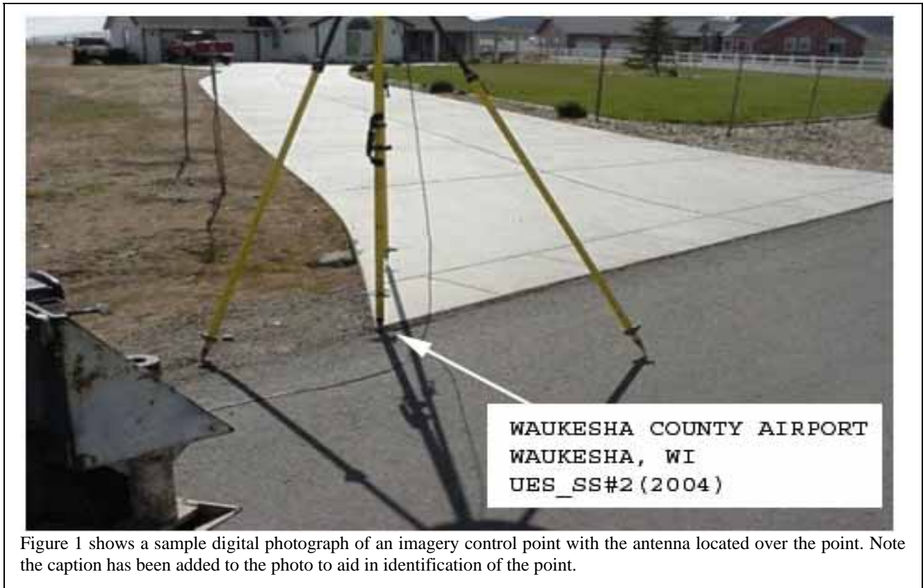
Figure 1 shows a sample digital photograph of an imagery control point with the antenna located over the point. Note the caption has been added to the photo to aid in identification of the point.

Document each image control station using the FAA Station Location and Visibility form (available at http://airports-gis.faa.gov ). Include on the form a sketch of the area surrounding the control point and a digital image of the control point and the surrounding area. In the sketch area of the form, list the file name used to identify the appropriate digital image for the station being described on the form. Complete a separate form for each control point.