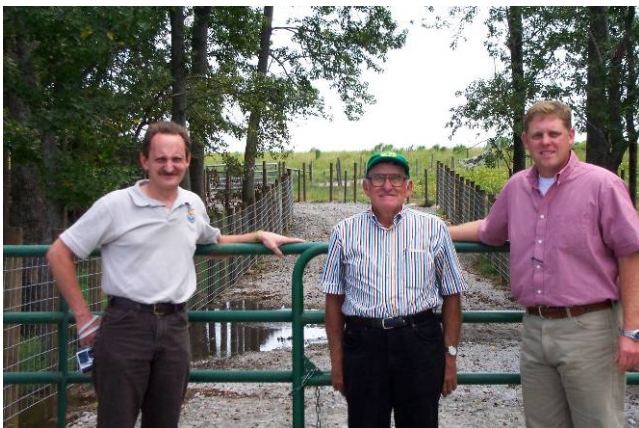
Partners for Fish and Wildlife biologist with landowner and a representative of the Georgia Soil and Water Conservation Commission.