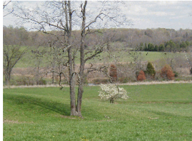
Each year in Virginia, about 35 miles of riparian corridors are protected from livestock overgrazing by installing fencing.

, A study has been initiated in southeastern Virginia to determine feasibility of restoring 800-1,000 acres of bald cypress and hardwood wetlands partially converted by a drainage canal in the 1960s. Forested