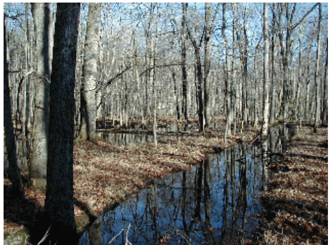
Restoration site after 80 ditch plugs were installed to restore the wetland hydrology.