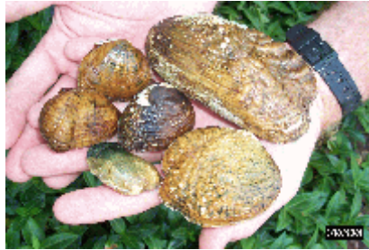
Federally listed freshwater mussels.

Virginia has expanded its wetland restoration efforts to include tidal marsh restoration along the Chesapeake Bay and coastal Eastern Shore. Stream restoration efforts have been expanded to include recovery activities for the federally endangered Roanoke logperch (a small fish) in the Roanoke River watershed and for the James River spiny mussel in the upper James River watershed.