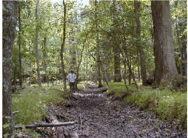
Site prior to hydrology restoration.