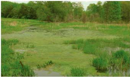
Warren Wetland Restoration