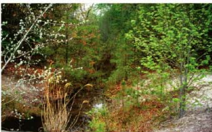
Lizard Tail Swamp Wetland Restoration