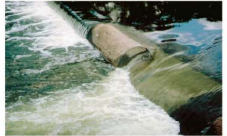
Calco Dam Fish Passage