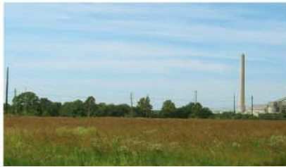
Ferro Upland Restoration