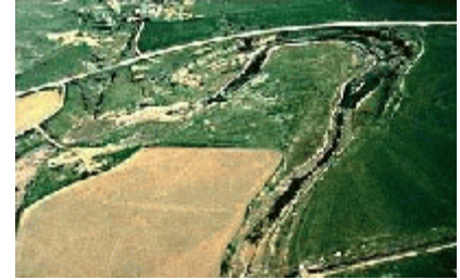
Oxbow restoration in the Lower Missouri River drainage.

An important landscape feature of Wyoming is the 2 million acres of wetlands scattered across the State. In arid climates such as Wyoming, these critical areas are home for many resident and migratory wildlife species. In fact, over 75 percent of all wildlife species rely on these wetlands for a part, or all, of their life cycle. In portions of the State, significant wetland complexes or concentrations exist and are targeted as focal areas for