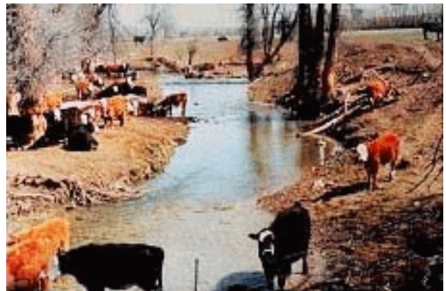
Cattle have free access to the stream.