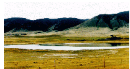
Porter Lake, a 50-acre restored wetland in Albany County.

When settlement came to the arid West, water and raw materials were critical for progress and