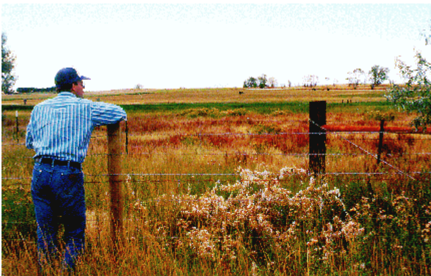
Fencing project in the Wind River drainage.

Riparian livestock and wetland fencing projects improve wildlife habitat and water quality while soil erosion is decreased by managing, maintaining, and improving vegetative cover on the stream banks. Grazing management plans complete the Partners package. For example, one Partners project involves two landowners along the Powder River who have