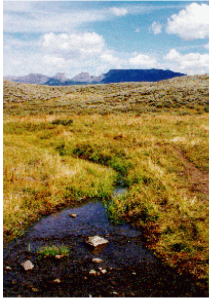
Wyoming prairie habitat.