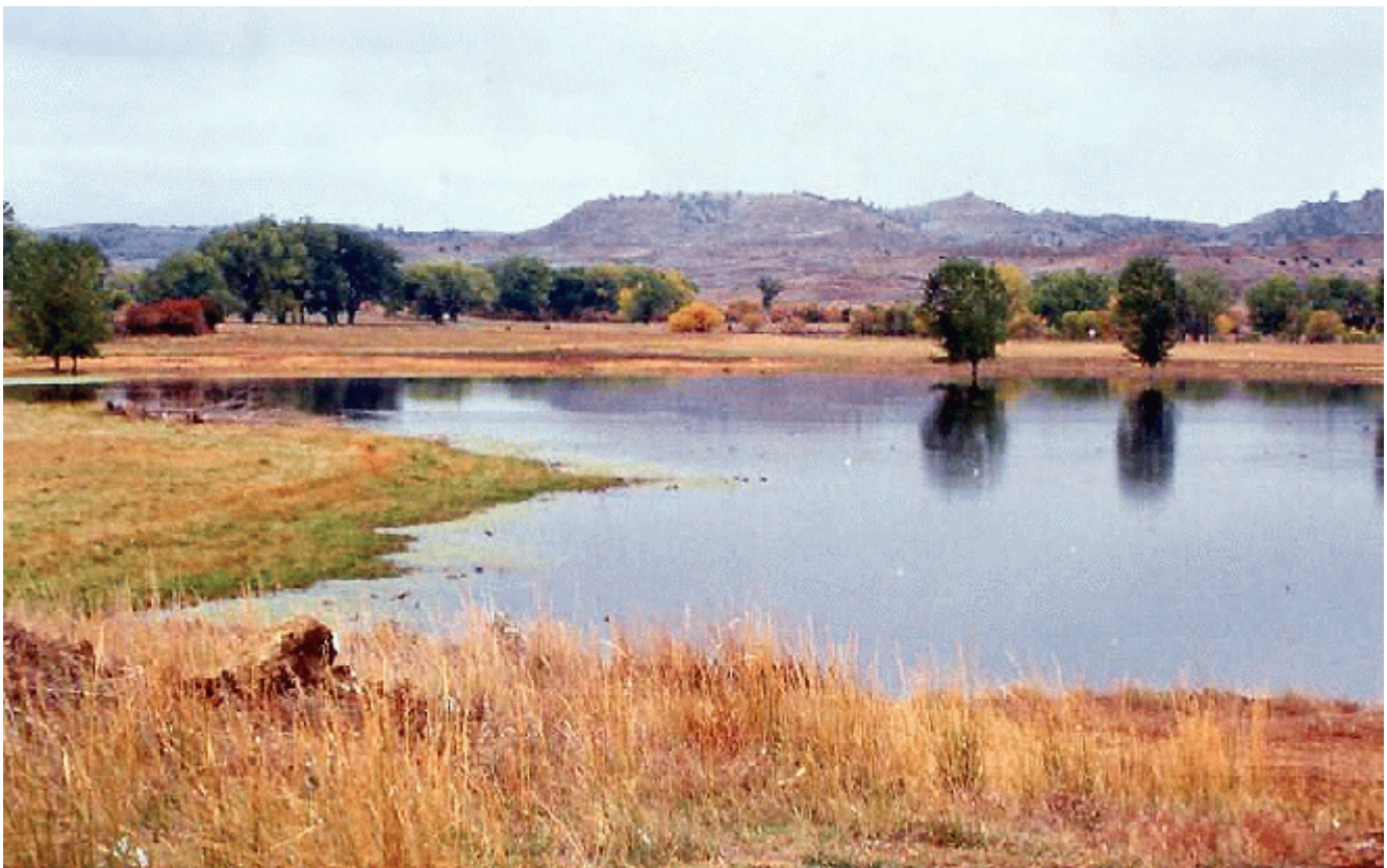
20-acre oxbow restoration near Sheridan in the Lower Missouri River Drainage.

Wyoming Game and Fish Department Natural Resources Conservation Service Wyoming Association of Conservation Districts Ducks Unlimited University of Wyoming Agricultural Cooperative Extension Service U.S. Environmental Protection Agency Pheasants Forever Bureau of Land Management Bureau of Reclamation City of Buffalo Union Pacific Railroad Wyoming Salvage U.S. Forest Service Farm Service Agency National Audubon Society National Wild Turkey Federation Rooster Boosters Wyoming Highway Department Wyoming Land Trust Texaco, Inc.