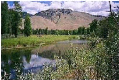
Wetland restoration along the Snake River.

on many forms from simple ditch plugs or earthen dikes to impound water to diverting irrigation return flow water into relic wetlands. The combination of oxbow wetland and riparian restoration not only benefit neotropical migratory birds in the area, but resident big game species such as elk, deer, and moose as well.