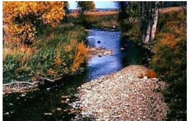
Same stream with a riparian grazing system.