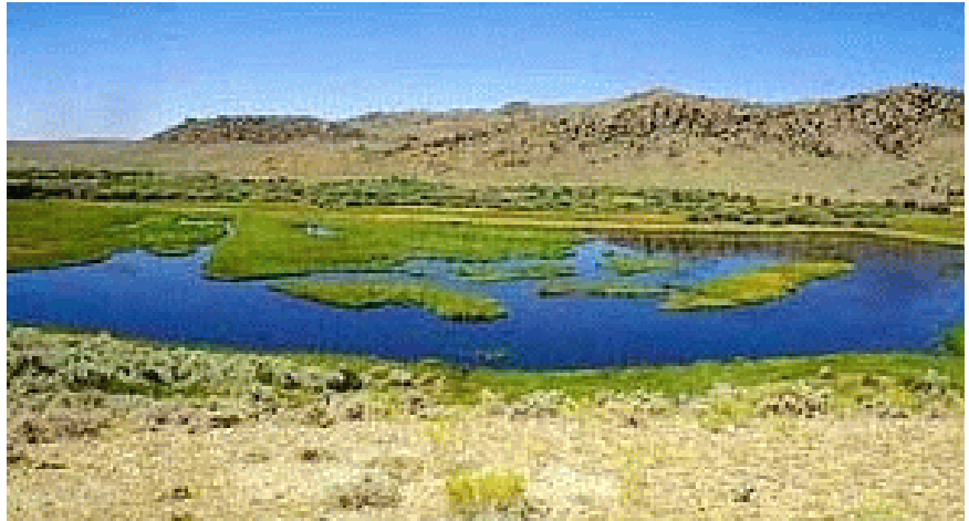
Captured irrigation return flow wetland.

Partners projects on the Green and Bear Rivers are designed to maintain and enhance waterfowl and fish habitat and improve irrigation efficiency. Riparian associated oxbow wetland restoration projects along with riparian livestock fencing benefit