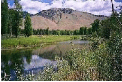
Wetland restoration along the Snake River.

cultivated fields. Forests were logged to supply construction lumber for growing communities, mineral industry, and rail companies. The once open grasslands and sage steppes were constrained by fences as the large herds of native migratory animals such as bison, elk, and pronghorn antelope were replaced with domestic livestock. The biological system that once evolved due to the dry climate, with fires, and great herds of migratory wildlife was brought under control. These visible and quantitative landscape conversions are long-standing, yet more subtle and possibly damaging