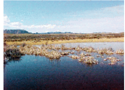
A Partners wet meadow restoration project in the San Luis Valley.

Funding for this work has been provided by Fish and Wildlife Service Partners for Fish and Wildlife Program, Endangered Species Landowner Incentive funds, and Challenge Cost Share Grants. Partner funding has come from the Colorado Division of Wildlife, Great Outdoors Colorado, Colorado Waterfowl Stamp sales, Ducks Unlimited, Playa Lakes Joint Venture, National Fish and Wildlife Foundation, and several