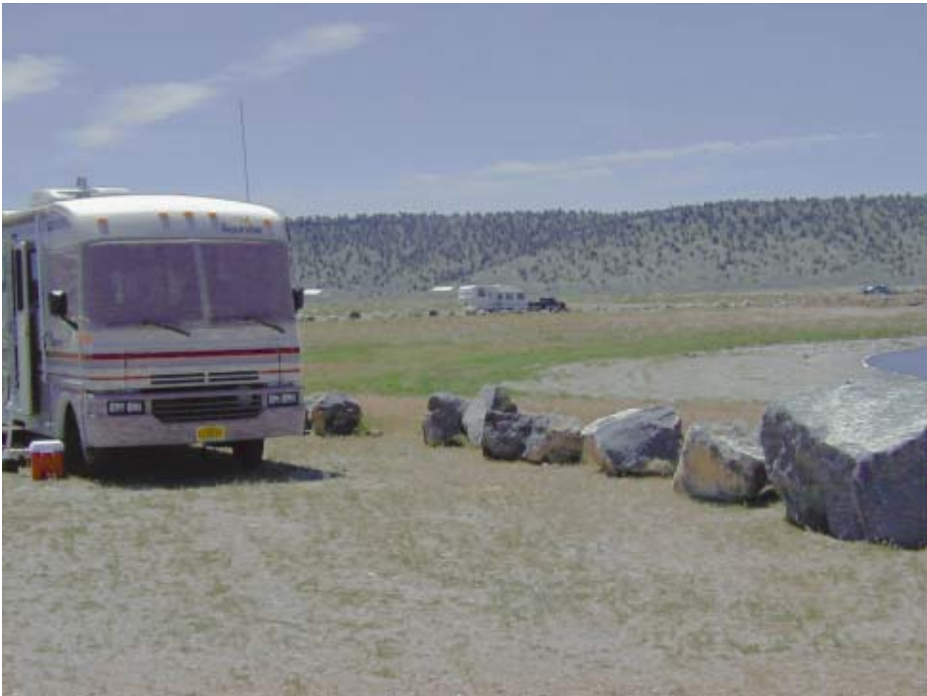
Chickahominy Recreation Site