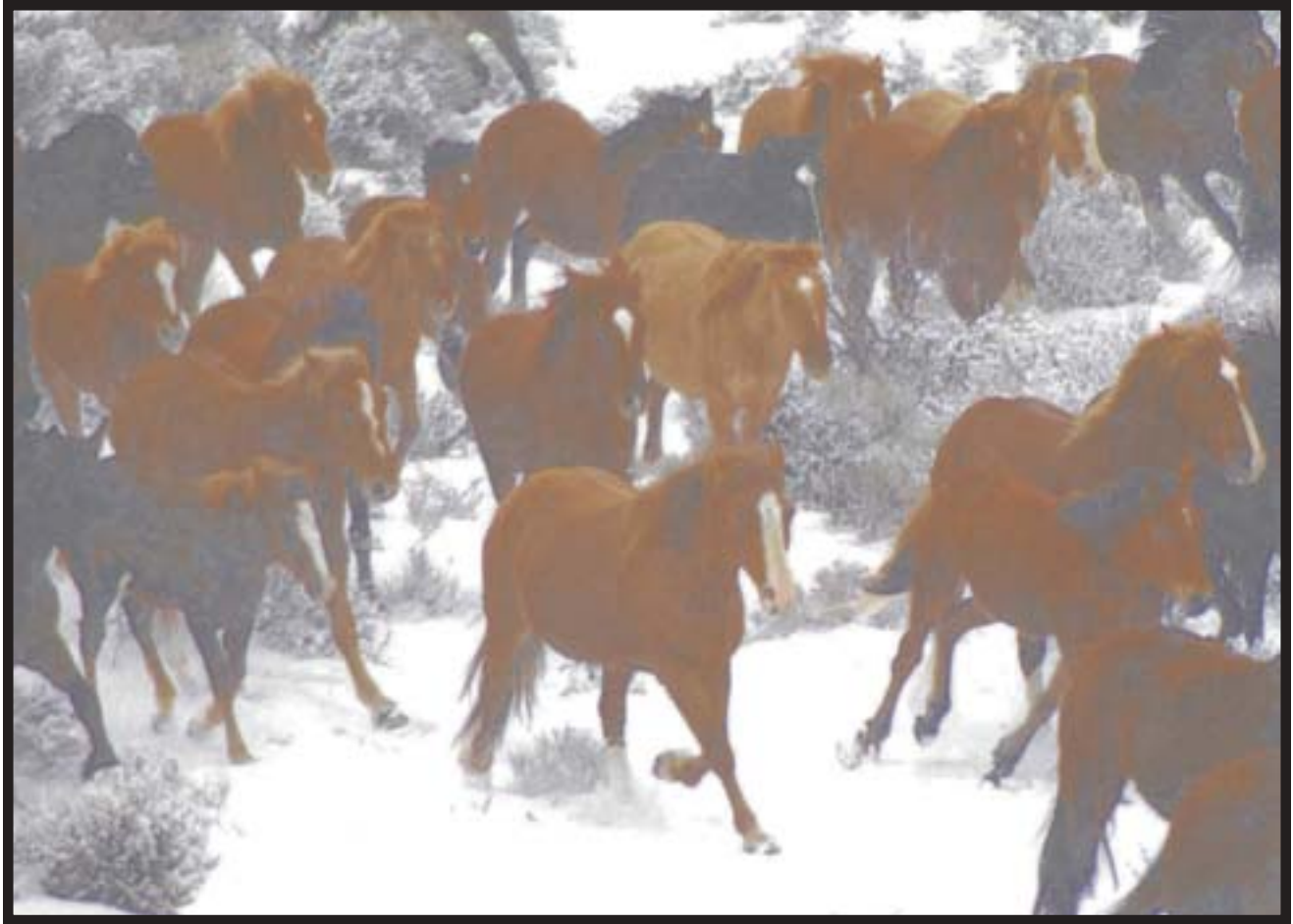
Coyote Lake Area