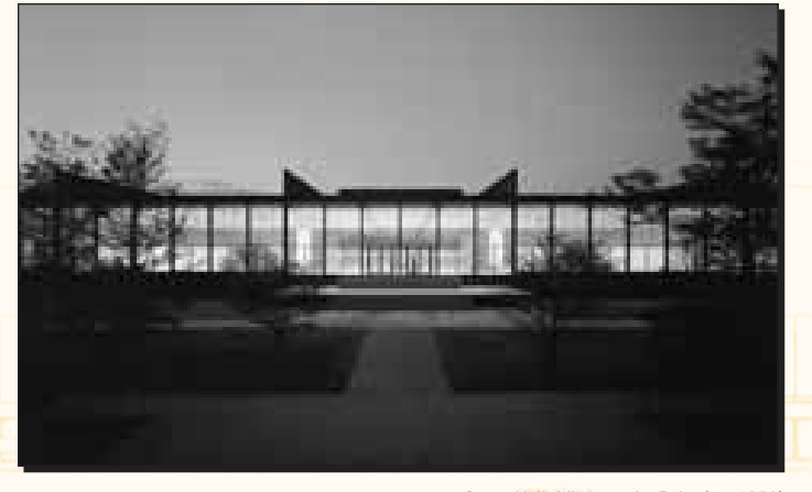
Crown Hall, Mies van der Rohe (ca. 1953)