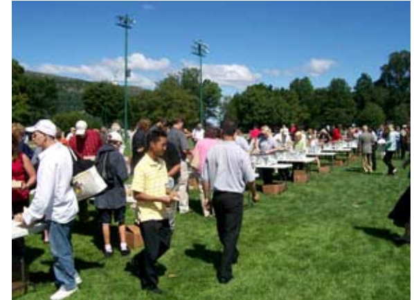
A-Day Family Picnic