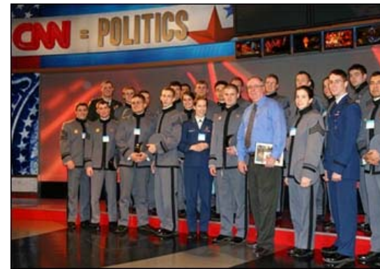
Class Trip to CNN