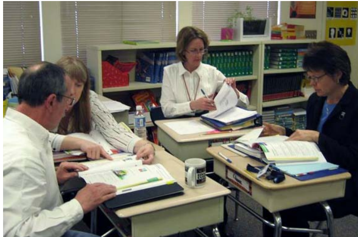
Teacher collaboration time is built into the school day.

Every Thursday morning in Spokane Public Schools, teachers arrive 30 minutes early and students arrive 30 minutes late, giving teachers 60 minutes of collaboration time. Teachers meet in small groups with their grade-level teams or in a large group with the goal of spending focused time discussing data, content, and critical strategies that create optimal learning for students. In the words of one teacher, “having the opportunity to collaborate is a big one.”