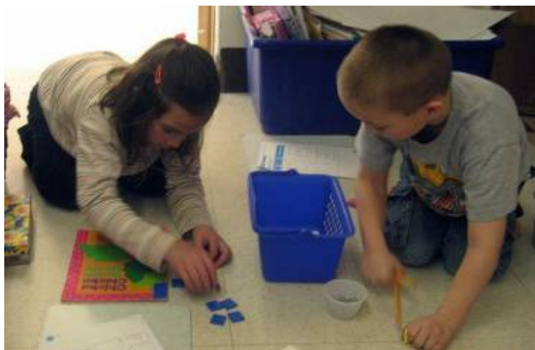
Madison made a five-year commitment to focus on mathematics instruction.

As one teacher noted, "The thing I am most proud of is that the work we are doing here is definitely preparing our students for success in middle school. The middle schools that our children go on to attend are asking what we are doing here with our kids, because they see a difference with our kids in comparison to kids from other schools" adding that this finding was not merely anecdotal: there are data to demonstrate this difference. "The most exciting thing," the teacher said, "is that one of the middle schools disaggregated their data by feeder school and Madison's kids were by far the highest achievers."