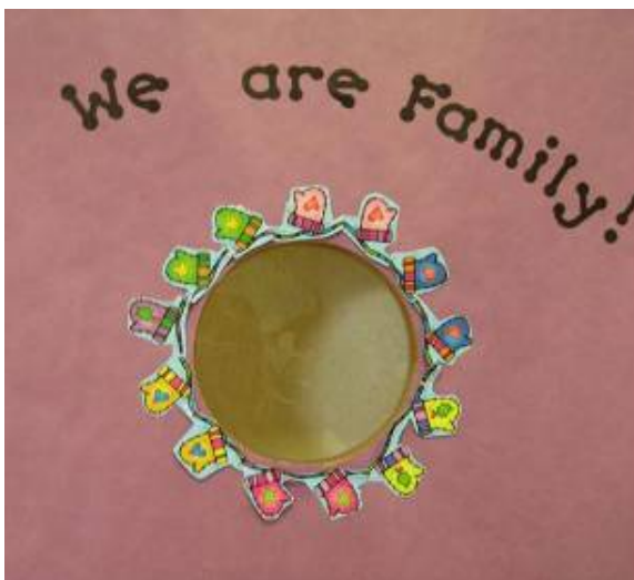
Madison staff members strive to give every student plenty of personal attention.