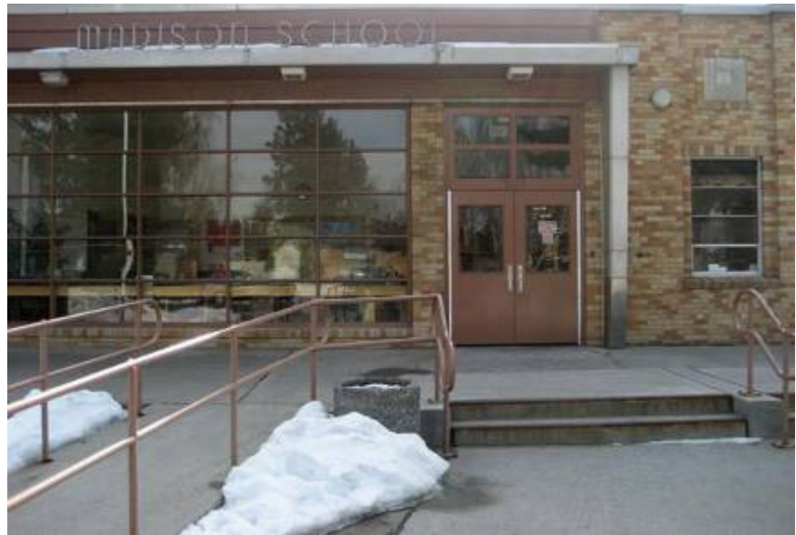
Madison's entrance reflects its late 1940's design.

When Madison Elementary School opened in 1949, its design was so forward-looking that the district superintendent invited 150 architects, contractors, and superintendents to the school for a day-long workshop on the essential features of a good school building.