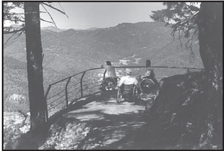
The scenic overlook on London Peak Trail, a one-half mile barrier-free trail (rated moderately difficult for wheelchair accessibility) just five minutes from I-5, meanders along a forested ridge line to the London Peak overlook, offering spectacular views of the Rogue/Umpqua Divide.

In addition to the activities listed above, the district issues approximately 150 special recreation permits for commercial or competitive activities. The majority of these permits are issued to commercial outfitters and guides on the Rogue River. Additional permits are issued for coonhound trials, paintball wars, hunting guides, equestrian events, bicycle events, automobile road races and OHV events.