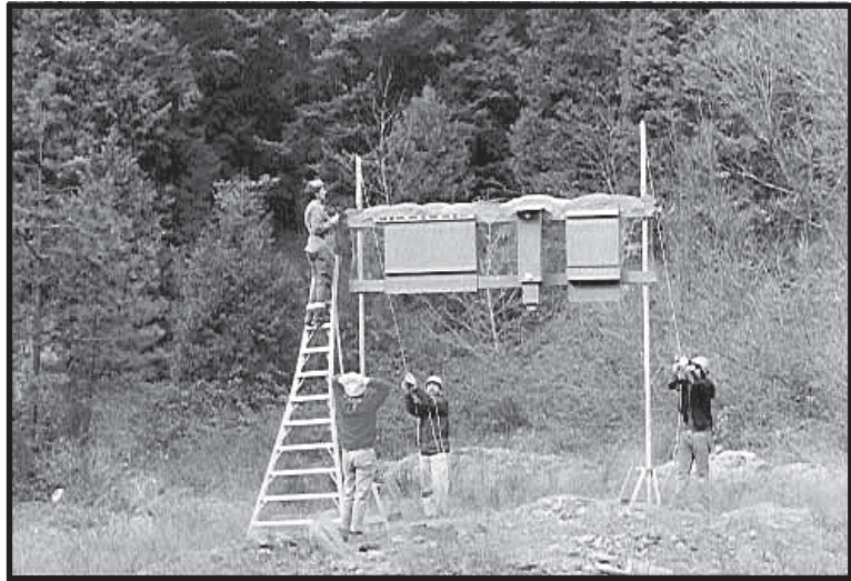
Glendale wildlife biologists install three artificial bat roosts to determine which type of roost area bats prefer.

In cooperation with Bat Conservation International, Boise Corporation, Southern Oregon University, the U.S. Forest Service, the National Park Service and volunteers, the Glendale Resource Area continued testing three artificial bat roost designs in forested areas across southwestern Oregon. Nine replicate sites were installed to make a total of 15, with two more planned in 2003. Bat populations were monitored at two caves and eight mine sites in the Grants Pass Resource Area.