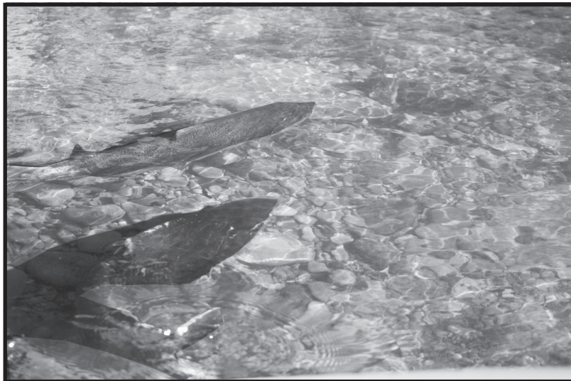
These spawning fish were seen during the Little Butte School Field Day.

Many educational presentations were conducted for watershed councils, schools, and various other community groups. Fisheries personnel taught schoolchildren about water quality, riparian vegetation, macroinvertebrates and salmon life cycles at several of Oregon Trout's Salmon Watch events held around the Rogue Basin. Free Fishing Day and CAST for Kids Day events were held at BLM's Hyatt Lake Campground, providing loaner fishing gear, boat rides and educational activities for the public. Examples of some of the other outreach activities in which fisheries personnel were involved include National Public Lands Day, the Junior Achievement Program and the Little Butte School Field Day.