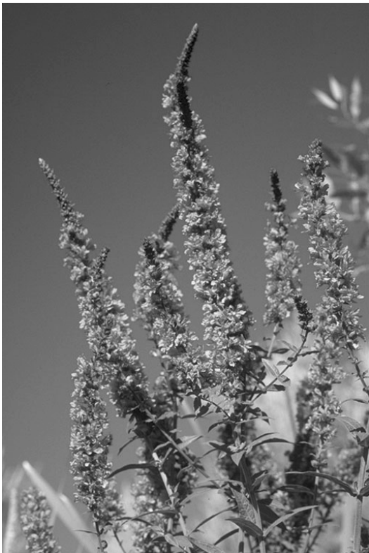
Purple loosestrife, one of the area's most invasive noxious weeds.