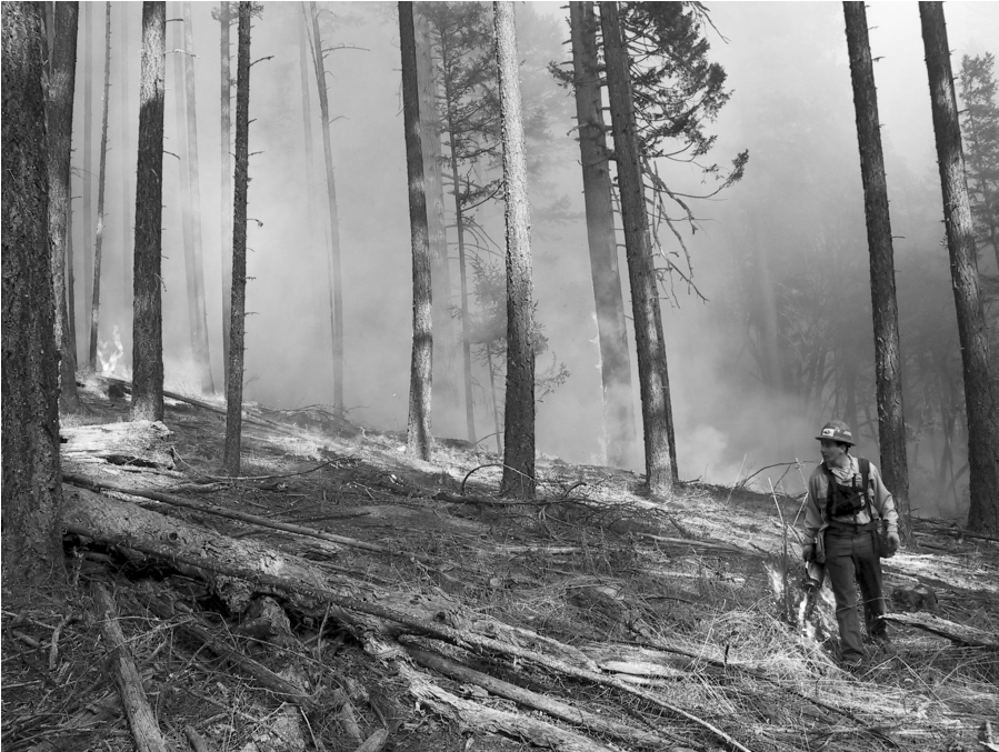
Underburns reduce fire hazards by decreasing fuel build up beneath the forest canopy.