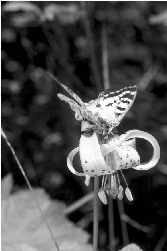
An American Apollo butterfly feeds from a leopard lily.