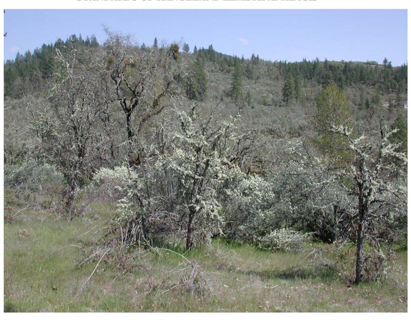
Reese Creek Allotment – STANDARDS OF RANGELAND HEALTH ANALYSIS