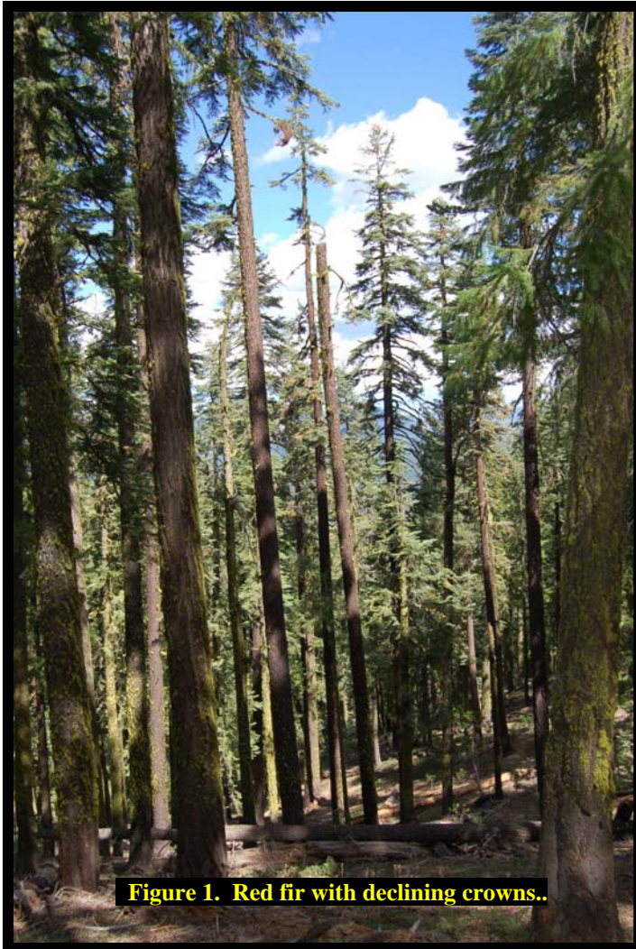
Figure 1. Red fir with declining crowns..