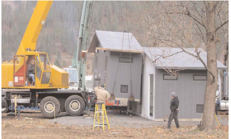
The Canoe Camp expansion will include a restroom. Here, the contractors are installing one of the prefabricated, reinforced concrete modules at Canoe Camp in November, 2005.

Comments will be accepted until February 18, 2006 and may be entered through the website or by surface mail to Bernard Fagan, National Park Service, Office of Policy, Room 7252, Main Interior Building, 1849 'C' Street, NW, Washington, D.C. 20240.