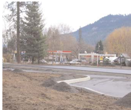
The new parking lot at Canoe Camp. The number of parking places will increase from ten to thirty-five.

On October 4, Canoe Camp closed to the public in order to begin construction of site improvements. To date the contractor, S & S Construction of Lewiston, has installed new curbs for an expanded parking area; extended the existing trail to the new property; constructed a maintenance storage building; and installed a new, permanent restroom.