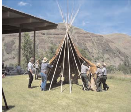
Park staff gingerly sets up the old buffalo hide tipi in June, 2005.

In conjunction with the photo shoot, the park hosted a workshop of local educators who were charged with creating curriculum-based lesson plans to accompany the web site. The lesson plans will allow teachers to appreciate and understand that museum objects can tell stories. The lesson plans will use the museum objects to highlight the culture and stories of the Nez Perce. The web site is scheduled to debut in spring, 2006.