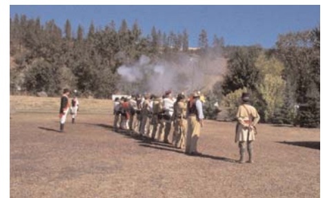
Reenactors fire a farewell salute at the closing ceremony of the bicentennial event in Kamiah, Idaho. A group of reenactors has accompanied Corps II since it began its journey west in 2003.