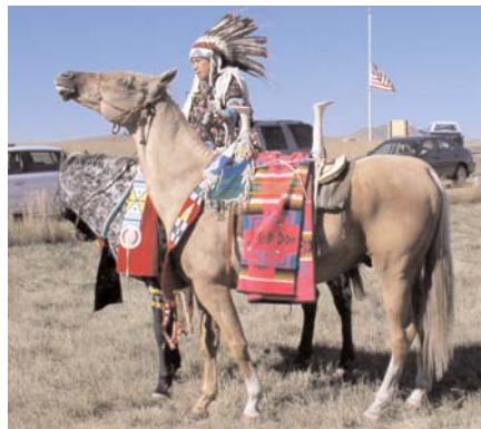
A riderless horse at the annual Bear Paw Battlefield commemoration honors the fallen warriors.

The annual Bear Paw Battlefield commemoration was held on Saturday, October 5, 2004. Nez Perce Tribal members from Washington and Oregon greeted the sunrise and sang songs of remembrance and mourning.