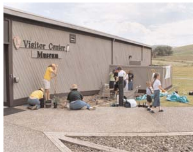
Park staff and volunteers work together planting shrubs at the entrance to the Spalding Visitor Center.

On June 6, 2004, fifty volunteers came to Spalding Visitor Center for a day of planting trees and shrubs at the Spalding Visitor Center.