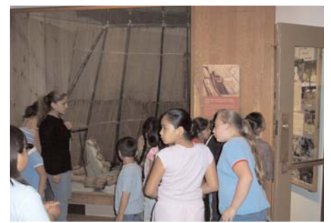
The children admiring their work on the opening day of the exhibit.

The summer 2004 Visitor Guide for Nez Perce National Historical Park and Big Hole National Battlefield is now available. If you would like to have copies for your institution or office, please contact the editor at (208) 843-2261, ext. 126 and copies will be delivered. A digital version is available at: www.nps.gov/nepe/NEPE_Summer .