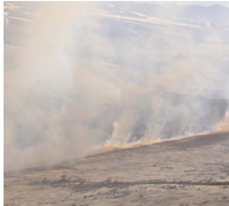
The fire at Whitebird Battlefield viewed from the overlook on Highway 95 (Photo courtesy David Rauzi, Idaho County Free Press).

On February 13 a local highway district slash fire escaped onto the adjoining White Bird Battlefield. Unseasonably dry condi-