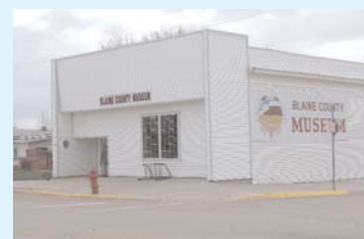
The Blaine County, Museum, Chinook Montana

Museum location and hours are found on the back page of this publication.