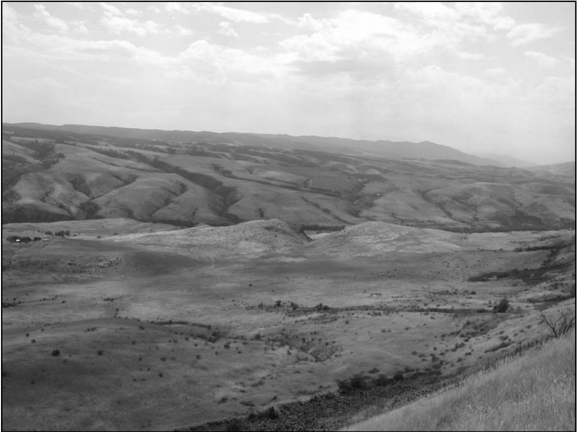
White Bird Battlefield as seen from the overlook on Highway 95.