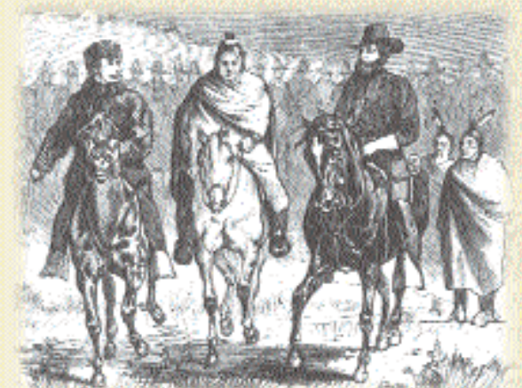
Scenes from the Nez Perce surrender, Harper's Weekly, 1877.

When the Nez Perce finally surrendered, it was more from exhaustion trying to elude forces under Gen. Oliver O. Howard (above) than from defeat. Their desperation is echoed in the words Chief Joseph reportedly spoke to Colonel Miles: "Hear me, my chiefs, I am tired; my heart is sick and sad. From where the sun now stands I will fight no more forever"