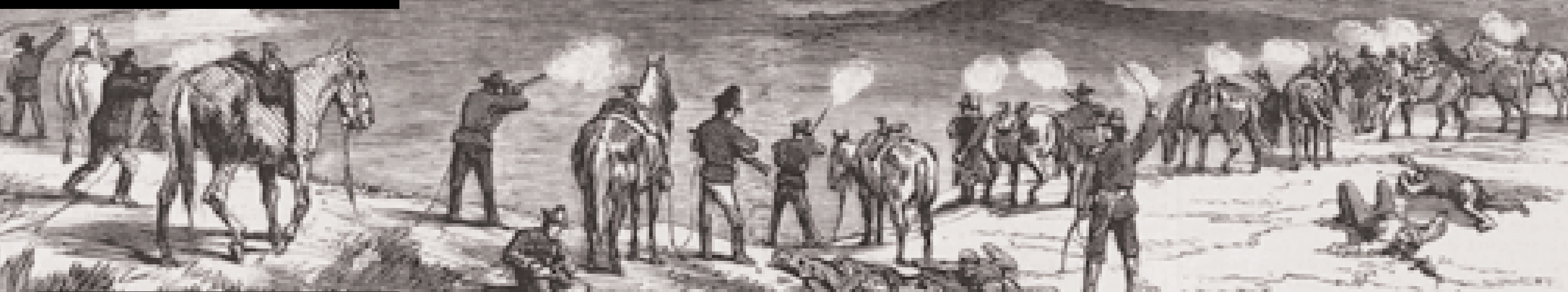
The Battle of the Bear's Paw, from a sketch by a Harper's Weekly artist.