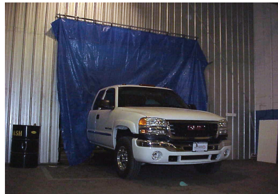
Truck in bed liner spray enclosure.

For additional information, see NIOSH Alert: Preventing Asthma and Death from MDI Exposure During Spray-on Truck Bed Liner and Related Applications [DHHS (NIOSH) Publication No. 2006-149]. Single copies of the Alert are available free from the following: