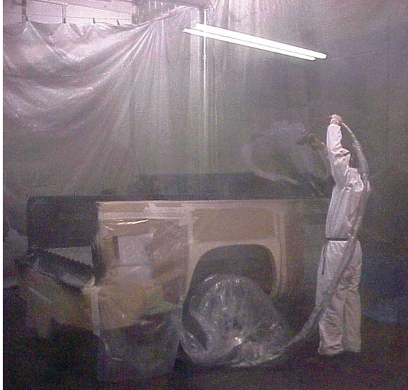
Figure 2. Spraying texturizing coat with protective equipment.

generally mixed in small quantities (quarts or gallons) at room temperature with a high-speed drill. Afterwards, the mixture is poured into a hopper gun and applied at 30–60 pounds per square inch from inside the truck bed. The chemicals used in the cold-batch operations typically contain less MDI (less than 20%). However, the cold-batch materials contain higher amounts of flammable solvents (toluene and N-butyl acetate) which should have their own exposure prevention and ventilation requirements. Cold-batch systems are popular because of the lower startup costs [Krupinski 2005].