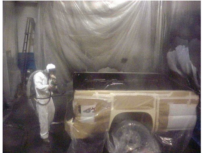
Spraying base coat with protective equipment.

For additional information, see NIOSH Alert: Preventing Asthma and Death from MDI Exposure During Spray-on Truck Bed Liner and Related Applications [DHHS (NIOSH) Publication No. 2006-149]. Single copies of the Alert are available free from the following: