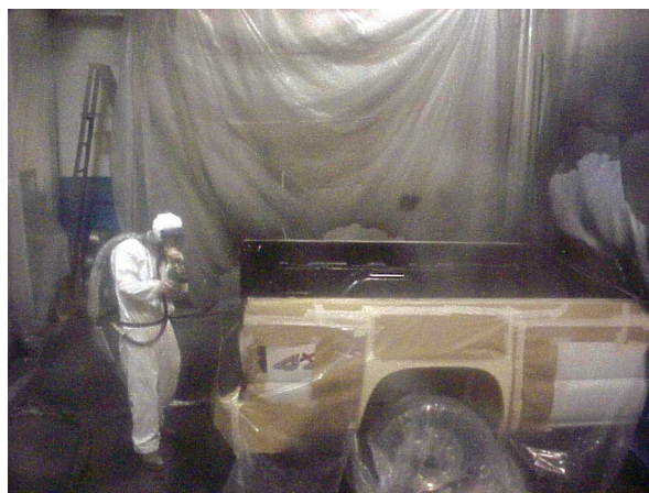
Figure 1. Spraying base coat with protective equipment.

NIOSH identified two spray-on processes commonly found in the industry [Heitbrink and Almaguer 2003]: one process applies truck bed liners at room temperature and