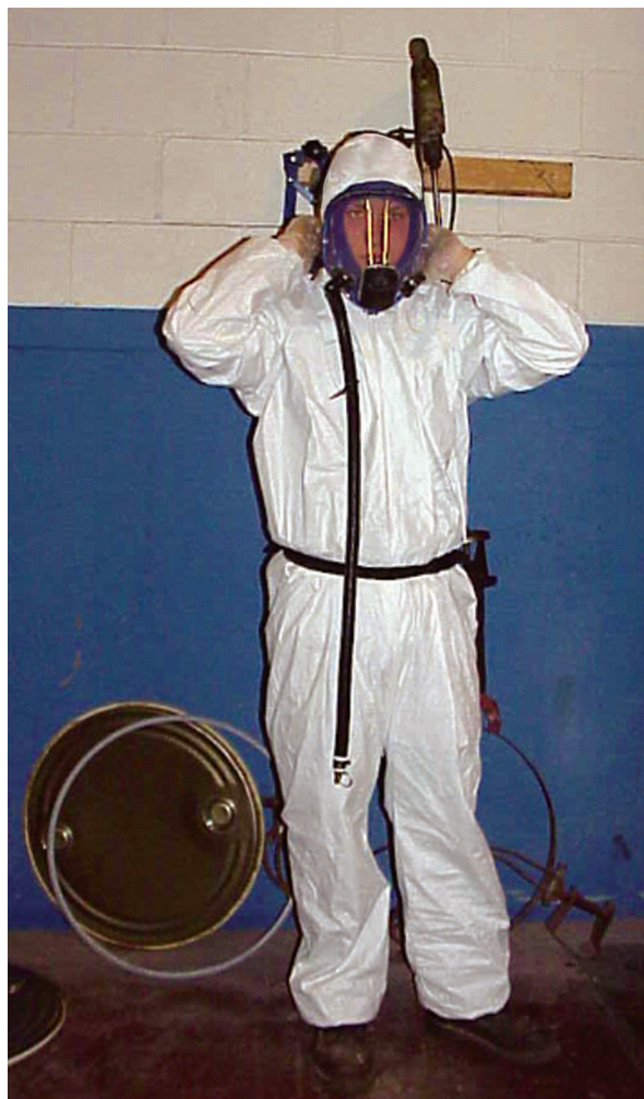
Figure 3. Worker wearing protective clothing and equipment.

When spraying MDI-based products or during entry immediately after spraying, wear