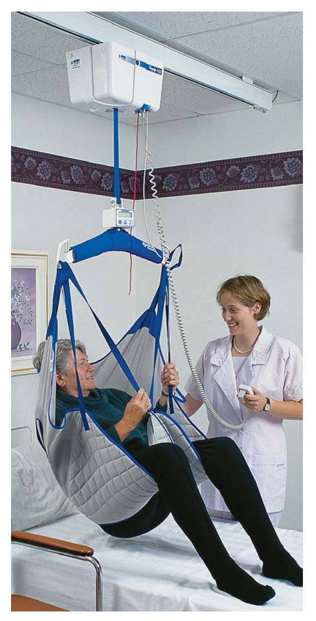
(4) What type and how much training is necessary to ensure that all of the caregivers are prepared to use lifting equipment?

Training should focus on how to use the lifting equipment for residents with a range of physical limitations, and should include hands-on practice. Caregivers should be required to demonstrate that they are proficient in the use of the lifting equipment for residents with a range of disabilities. Training is generally provided