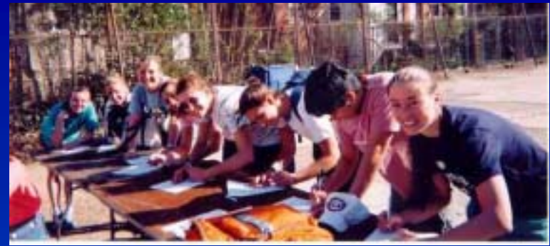
Injury Free Coalition for Kids of Philadelphia