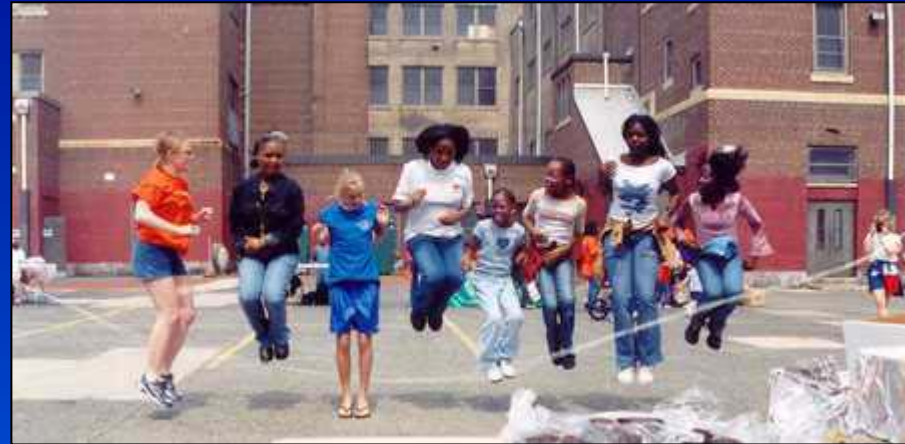
Injury Free Coalition for Kids of Philadelphia