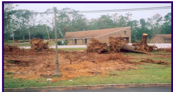
Devastation missed this church in Tyler Town, MS.