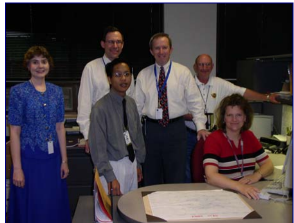
SPS End-Users at GSA, happy with the results

Rollout to the other 129 customer agencies will take approximately 35 weeks. Agency readiness will be the all-important factor as to when KFC personnel will visit customers. Readiness involves obtaining the necessary hardware, internet connectivity and dial-up capabilities; identifying all End-Users; preparing and submitting the paperwork (i.e. PKI forms); all accesses requested by RFC personnel for certificates; authentications received prior to visit; and all RFC tables and files updated.