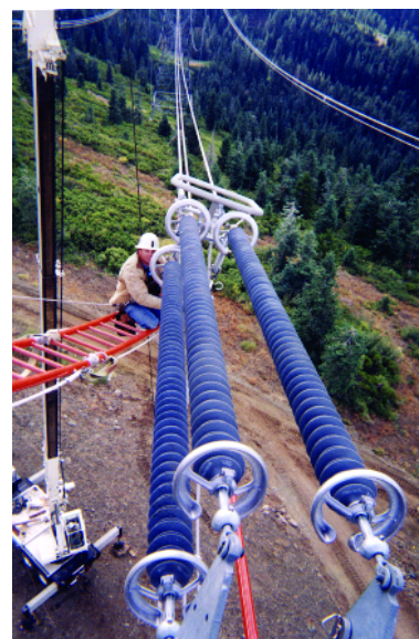
Direct Current. The Administration proposes that the PMAs be allowed to directly fund improvements to Bureau of Reclamation and Corps of Engineer facilities.

BPA finances its $3.7 billion annual cost of operations and investments primarily using power revenues and loans from the U.S. Treasury. The amount of loans from the U.S. Treasury is currently capped by statute at $4.45 billion. BPA has also started seeking non-Federal