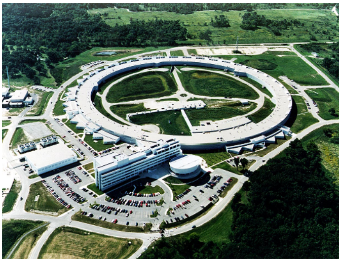
The Advanced Photon Source at Argonne National Laboratory outside of Chicago, Illinois is 3,640 feet in circumference (large enough to encircle Wrigley Field) and will host 2,500 users in 2005.