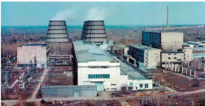
Coal Comfort. This Soviet era weapons-grade plutonium-producing nuclear power facility in Seversk, Russia will be replaced, under NNSA leadership, with a coal burning facility.

In June 2002, under the leadership of the United States, the G-8 nations agreed to a new comprehensive nonproliferation effort known as the Global Partnership. The goal of the Partnership is to stop the spread of weapons of mass destruction, related materials and technology, and expertise. To achieve the goal, the G-8 leaders committed to spend up to $20 billion over 10 years to fund nonproliferation programs in the former Soviet Union. The United States intends to provide half of the total funding through programs in DOE, DOD, and the Department of State. The 2005 overall request for Global Partnership programs totals nearly $1 billion and consists of: