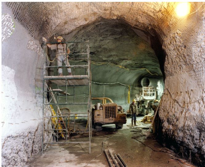
Due to open in 2010.

DOE is charged with disposing of the spent nuclear fuel generated by civilian nuclear power plants, Government nuclear reactor facilities, and the high-level waste from the Nation's defense activities. More than 161 million Americans live within 75 miles of the 131 sites in 39 States that currently store spent nuclear fuel and high-level radioactive waste. In February 2002, the President recommended the Yucca Mountain site to the Congress as being qualified for a construction permit application to the Nuclear Regulatory Commission (NRC) as a nuclear waste repository. The Congress approved that recommendation in July 2002. The successful completion of a repository at Yucca Mountain will ensure the Nation has a single underground facility, secure from potential terrorist threats, that stores nuclear waste in a manner that protects the environment and our citizens.