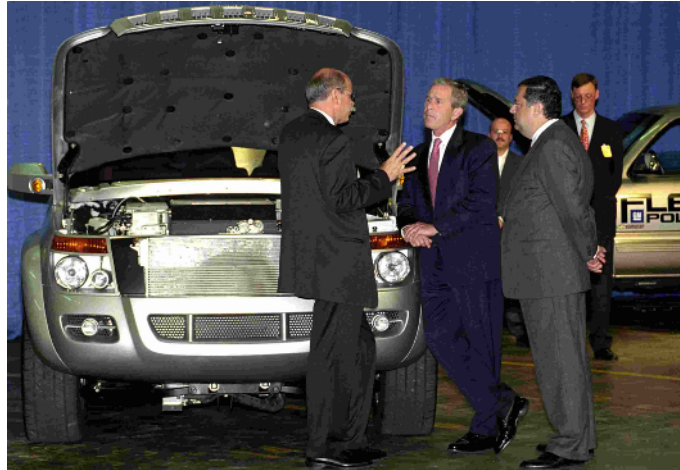
President Bush and Secretary Abraham inspecting a fuel cell vehicle.

Key Components: 24 research laboratories and facilities, four power marketing administrations, and 114 contaminated cleanup sites affecting about two million acres of land.