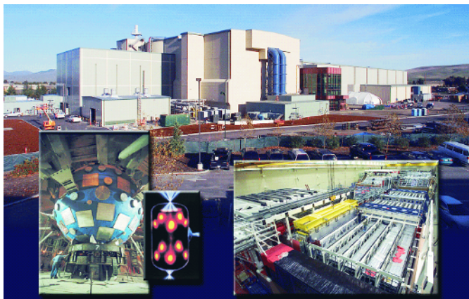
The National Ignition Facility, at Lawrence Livermore National Laboratory, is a cornerstone of NNSA's science-based nuclear stockpile stewardship program that ensures the long-term safety, reliability, and effectiveness of the stockpile without nuclear testing.