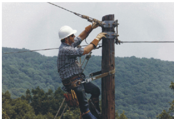
I am a lineman for the country. Local transmission problems can lead to regional blackouts. The Administration is leading a national effort to improve transmission reliability.