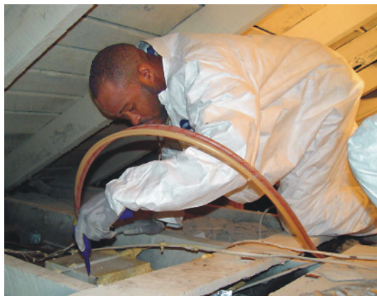
What's in your attic? Energy efficiency improvements can save more than $4,000 per home.