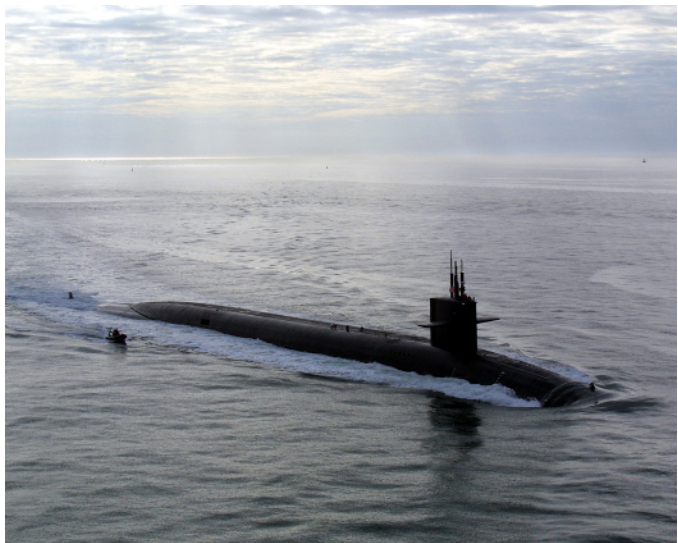
The USS Florida steams under the power of reactors developed by NNSA.

NNSA's Naval Reactors program continues its impressive record developing safe and reliable nuclear reactors to power the Navy's warships. The program is responsible for all naval nuclear propulsion work, beginning with technology development, continuing through reactor operation and, ultimately, to reactor plant disposal. The Naval Reactors program is currently developing nuclear propulsion plants to support DOD's efforts to transform itself for 21 st Century national security requirements. By the end of 2005, the goal is to complete 70 percent of the design of the next generation aircraft carrier reactor. Furthermore, the Naval Reactors program will continue work on its Transformational Technology Core, which will deliver a significant energy increase to future submarines.