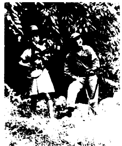
Two Kachin guerrillas supporting Detachment 101 in Burma.