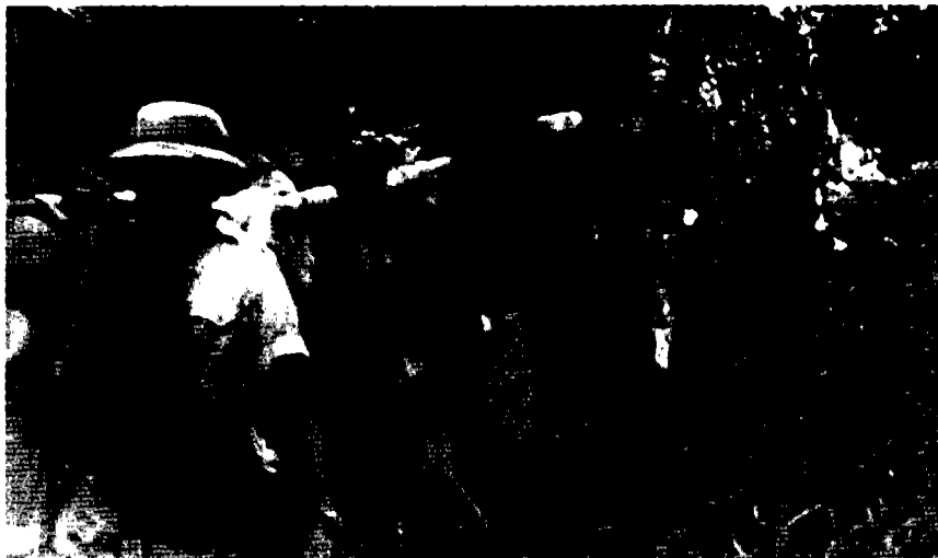
American and Burmese recruits training for behind-the-lines service with Detachment 101.