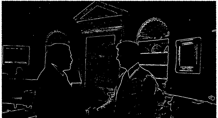
President Jimmy Carter expresses his appreciation to author for his key role in the exfiltration operation.

I showed the President some of the cover materials used in the operation and told him the Argo/Argau story. Because of some indecision about whether the White House photographer should take my picture shaking