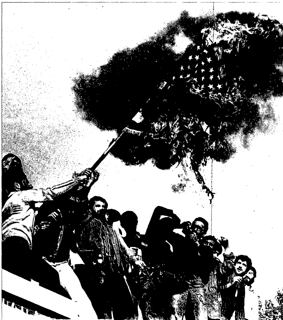
Iranian demonstrators burn American Flag on wall of US Embassy shortly after takeover by militants in November 1979.