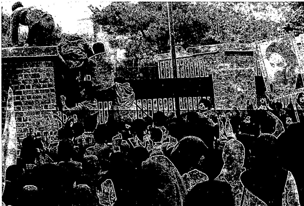
Iranian militants invade US Embassy, November 1979.

Beginning in the early 1970s with the sale of 72 advanced F-14 Tomcat fighter-interceptor aircraft to the Iranian Air Force, the United States steadily built up the Iranian military. Iran was the only country in the world to which the United States had sold the F-14. In the pipeline by 1979 was about $6 billion worth of military materials, including four technologically advanced Spruance-class destroyers. A side benefit of this largess was Iranian permission for the United States to establish and maintain two sensitive signals intelligence collection sites in the northern part of the country to intercept data link communications of Soviet missile tests.