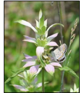
Karner blue butterfly