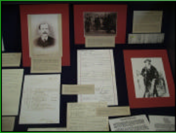
Exhibit topics are varied and showcase the wide variety of records we hold. Exhibits bring to life the stories of our nation's history and teach the public about the value of research and historical events.

The Central Plains Region offers small, temporary exhibits in its main lobby area.