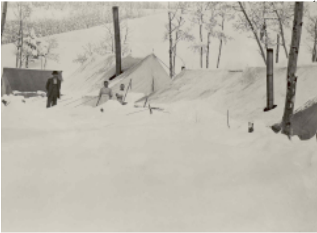
Snow Banks in the Pike National Forest, 1912 RG 95; NARA Rocky Mountain Region